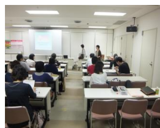
Lecture meeting at Sendai City

We are in the fourth year of our East Japan Support Project offering support to prevent children's trauma through Second Step. Our approach combines (1) lecture meetings where we emphasize the need to pay attention to children's emotional well-being and share the effects of Second Step, (2) training meetings for promising organizations (where they attend free of charge and receive free Second Step materials), and (3) follow-up group visits by our Master Trainers for demonstration and continued support.