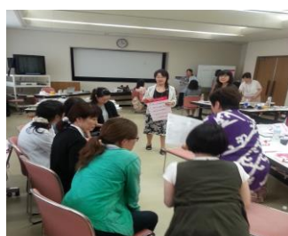
Training Meeting at Sendai City

We conducted four training meetings and two follow-up group visits, devoting 1,017,000 yen which is 5% of our training revenue and with your donations added, this was accomplished by East Japan Support Project of 2013. 17 people learned Second Step at no expense and 12 set of materials were given free. They taught the Second Step skills to about 120 children. As an example, a teacher of the elementary school in Fukushima practiced Second Step and a child came to be able to control emotions with the skills he learned. Parents of the child felt grateful to the teacher.